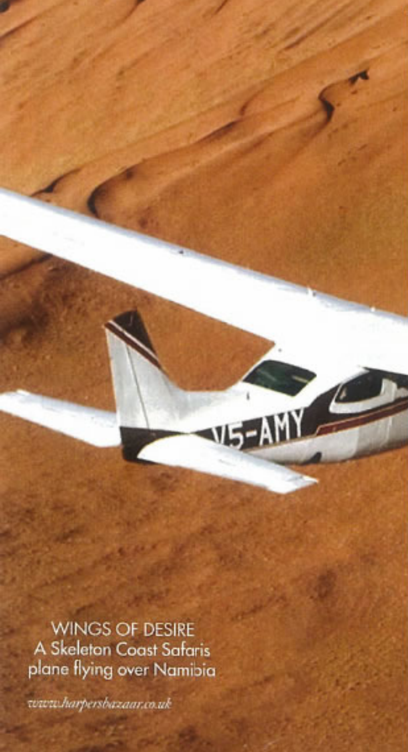
WINGS OF DESIRE A Skeleton Coast Safaris plane flying over Namibia

From airborne thrills over the Skeleton Coast to gorilla-spotting in Rwanda, river cruising in Ethiopia and scuba diving in Tanzania, here are the most breathtaking wildlife adventures you will ever know