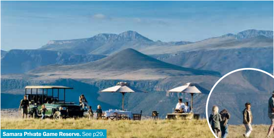
Samara Private Game Reserve. See p29.